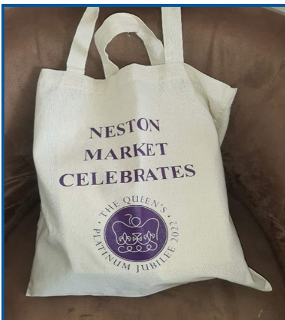
Commemorative tote bags provided additional advertisement for Neston Market

In addition to supporting community events, the Town Council organised a special Jubilee Market which took place on Friday 3 rd June 2022. As well as activities for children, entertainment by Little Actors Theatre Company, and The 64 N'Ukes, the Town Council provided commemorative Jubilee tote bags to shoppers which were available free of charge.