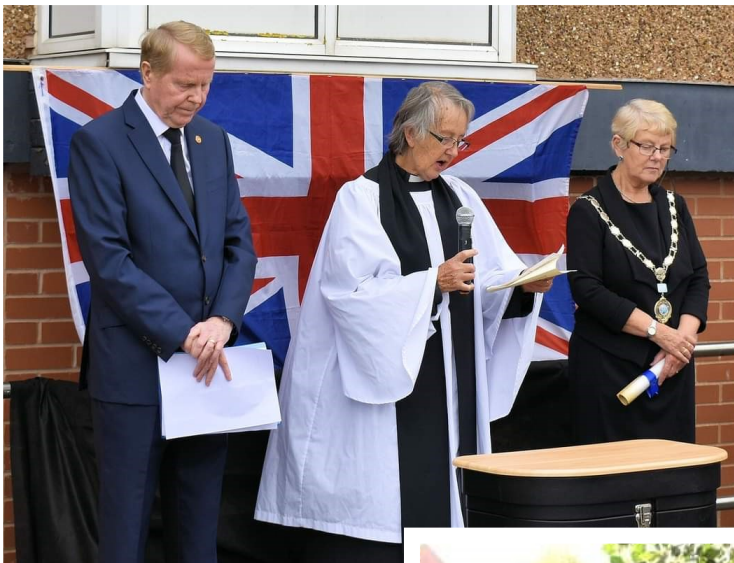
(Above & left) King Charles III Proclamation Day in Neston