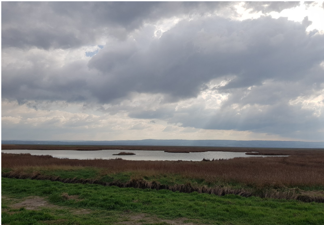
Parkgate Marshland.